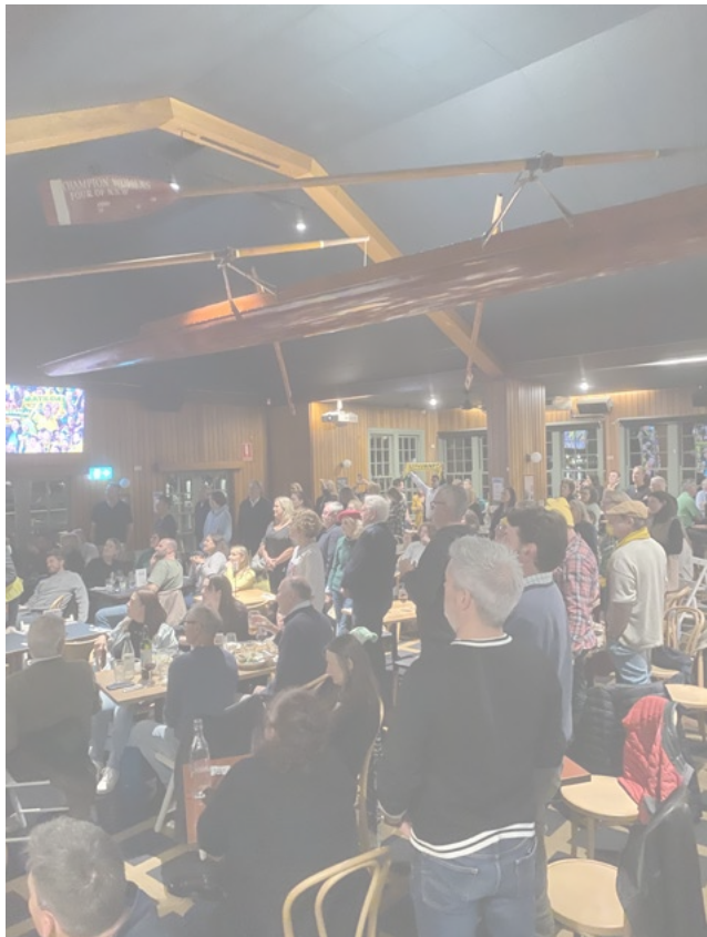
What a turnout for the Matilda's game!